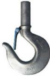
SHANK HOOK G 13